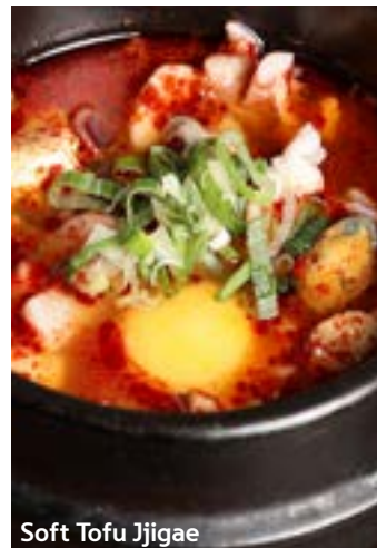
Soft Tofu Jjigae