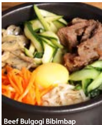
Beef Bulgogi Bibimbap