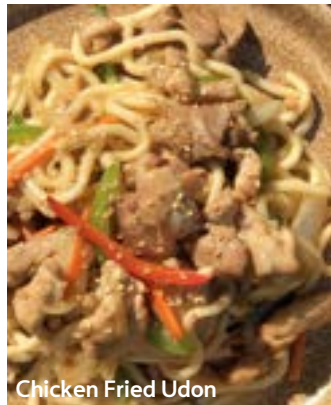
Chicken Fried Udon

*If you have a food allergy, please notify a member of our staff.