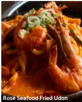
Rosé Seafood Fried Udon