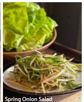
Spring Onion Salad

*If you have a food allergy, please notify a member of our staff.