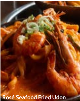
Rosé Seafood Fried Udon