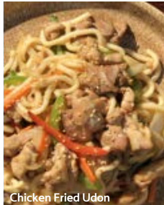
Chicken Fried Udon