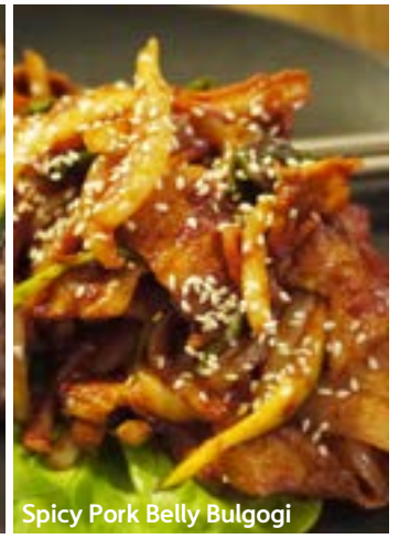
Spicy Pork Belly Bulgogi