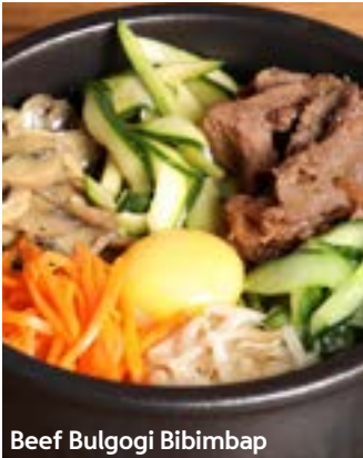
Beef Bulgogi Bibimbap